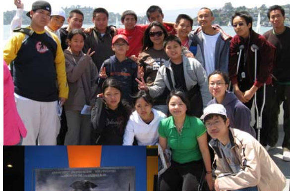
Top: The students on the Ferry to Angel Island