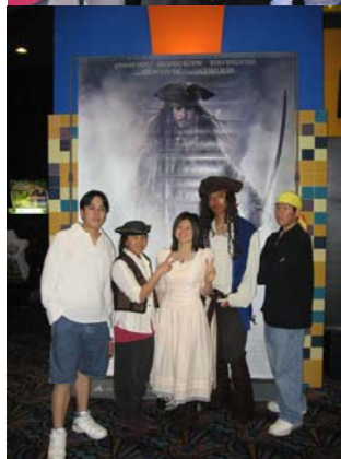
Left: A few students all dressed up to watch "Pirates of the Caribbean 3"

hard and realize revelations about life when we have been stumped with crisis in the midst of a blooming career or raising a family.