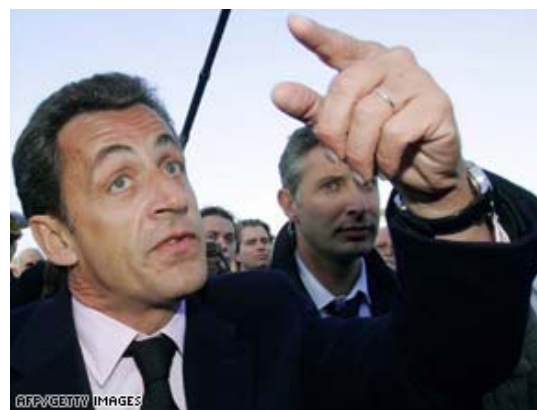
Top: Nicholas Sarkozy

buildup to the Iraq war. In a interview with the British newspaper The Daily Telegraph , Pierre Moscovici, the French Socialists' spokesman on international affairs, said that Sarkozy is playing a dangerous game and risks putting France in a position where it would be unable to have any critical dialogue with the United States.