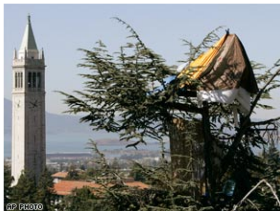
Evicting the residents of this tree house overlooking Cal's Campanile Tower may not be easy.

but are worried too of the future outcome.